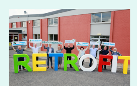
NI and ROI Funds